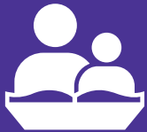
EARLY CHILDHOOD LITERACY